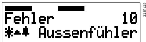
Example of own fault display

In the case of a room unit-specific fault or a fault of Siemens boiler control, the error code and appropriate error text will be displayed.